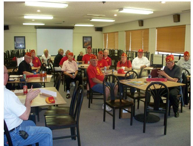
May's business meeting was a successful turnout

We had 18 members and 3 guests present to discuss our upcoming bid for the 2011 Marine Corps League National Convention , hopefully here in Boise, Idaho. From the Commandant and Staff Officers..... Thanks to everyone for showing up for this very important staff meeting. Our next meeting is for June 18 th , (Third Thursday of the month) at the Pavilion bldg on Gowen Field. Time; is 1900. Unless I'm stepping out of line I will also add an announcement from May's meeting. We are asking for a donation of $325.00 by July 10 th . More details on this during our June's meeting. Please be there and let's have another great turnout....Semper Fi Marines.